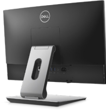
OPTIPLEX 5270 ALL-IN-ONE ARTICULATING STAND

Tilt your display forward, backward, or recline to a 60 degree angle. This stand makes touchscreen interaction comfortable.