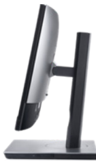
OPTIPLEX 5270 ALL-IN-ONE DVD+/-RW IN HEIGHT ADJUSTABLE STAND

Raise, tilt, pivot or swivel your All-In-One with a stand that delivers personalized comfort and viewing angles.